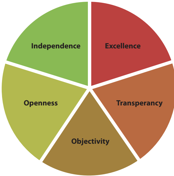
Figure (1): Our values

The Institute plays its role within the system of national values in promoting a culture of moderation, the rule of law, good governance, and the enhancement of democratic life. The most important values that guide our mission as Politics and Society Institute are illustrated by Figure (1):