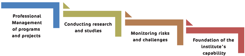
Figure (3): Strategic areas of work

The institute's work is carried out in accordance with four mechanisms of action described in Figure 3: